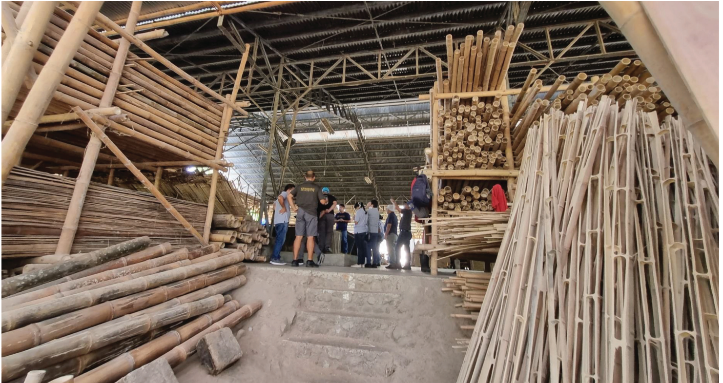
Workers learning about the sustainable qualities of bamboo in construction.