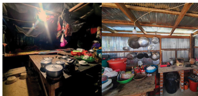
Yip Say's previous kitchen had no concrete floor.

"I'm very grateful to live here. I'm no longer worried about living on someone's land, not scared of living alone. There are many people around me".