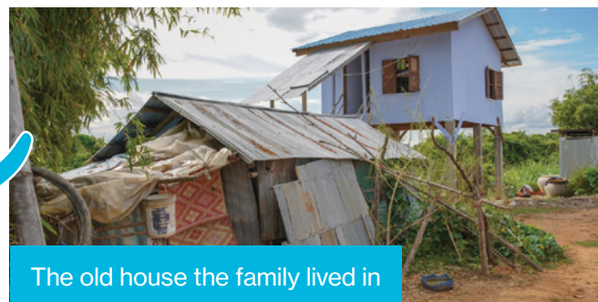
The old house the family lived in

“After we received the new house, we received the grant support to implement my family development plan. I have a bigger plan to expand my farm by saving from my income. I strongly believe that soon my family will be in better financial situation.”