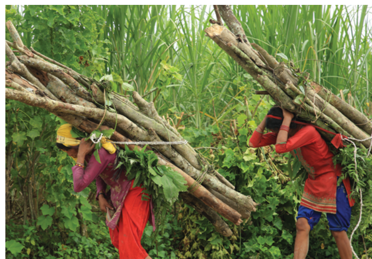
Women carrying heavy bundles of wood on their heads to sell at the market, as Palhas would do each day.

Palhas would take on several seasonal agricultural jobs to provide for her daughters, walking nearly three hours each day to the jungle to fetch heavy bundles of wood to sell at the markets, carrying them on her head.