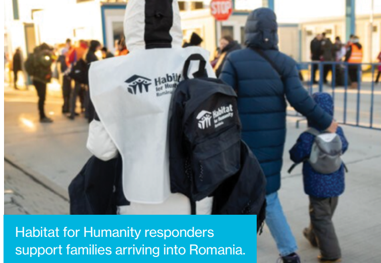
Habitat for Humanity responders support families arriving into Romania.

When we saw the tanks roll in, I did not know what to say to the children anymore. We cried