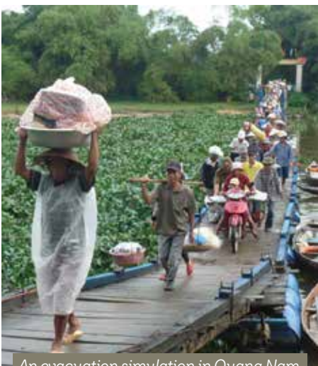
An evacuation simulation in Quang Nam

In Quang Nam, Central Vietnam, we are running a Disaster Risk Reduction project thanks to the support of international building and construction materials company, Boral – our Building Disaster Resilience program partner.