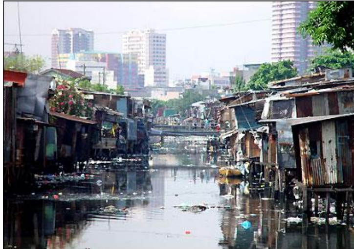
Urban Slum, Manila

The outcome of capitalist urbanisation results in a spatial change in the way global Asian cities are organised. A visit to Mumbai, Manila, Phnom Penh or Jakarta, among others, reveals this urban spatial reality clearly. The division is one between classes of people who can afford formal urban plots or apartments and those who cannot and are forced to live in deprivation within city slums.