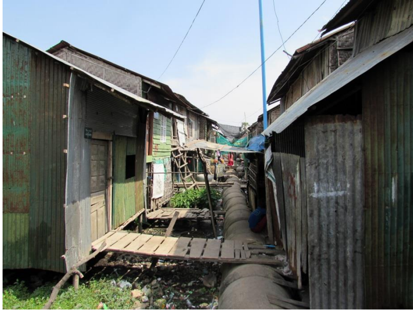
Urban slum, Phnom Penh, Cambodia

As a way of understanding and measuring poverty alleviation, Capabilities Approach challenges the dominant - arguably crude - and exclusively economic GDP model of measuring development's progress. This paradigm shift has been instituted by Nassbaum's work with Nobel Prize winning economist Amartya Sen and is the foundation for the annual Human Development reports published since 1990 by United Nations Human Development Report Office.