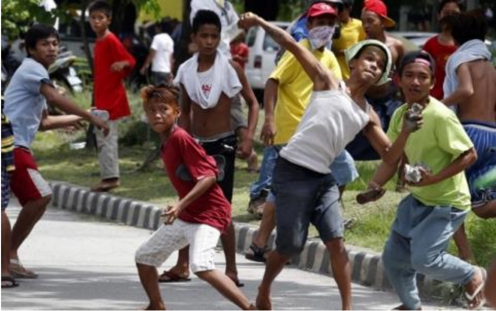
Slum riots, Manila